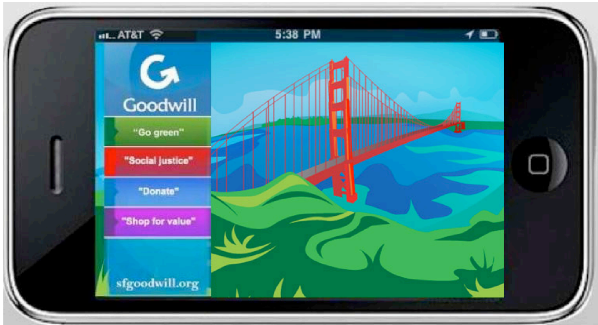
Goodwill Bay Area app for iPhone & Android January 2012